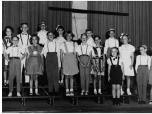
School Dance Revue 1951