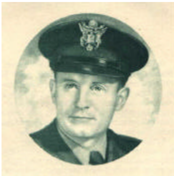
Chaplain Emil J. Kapaun

(* Note on Gospel Meditation: A most efficacious time to pray for loved ones in the military and for increased Catholic vocations to the military chaplaincy is just before Communion, when the words that caused our Lord to marvel at a soldier's great faith are immortalized in Mass: "Lord, I am not worthy to receive you, but only say the word and I shall be healed.")