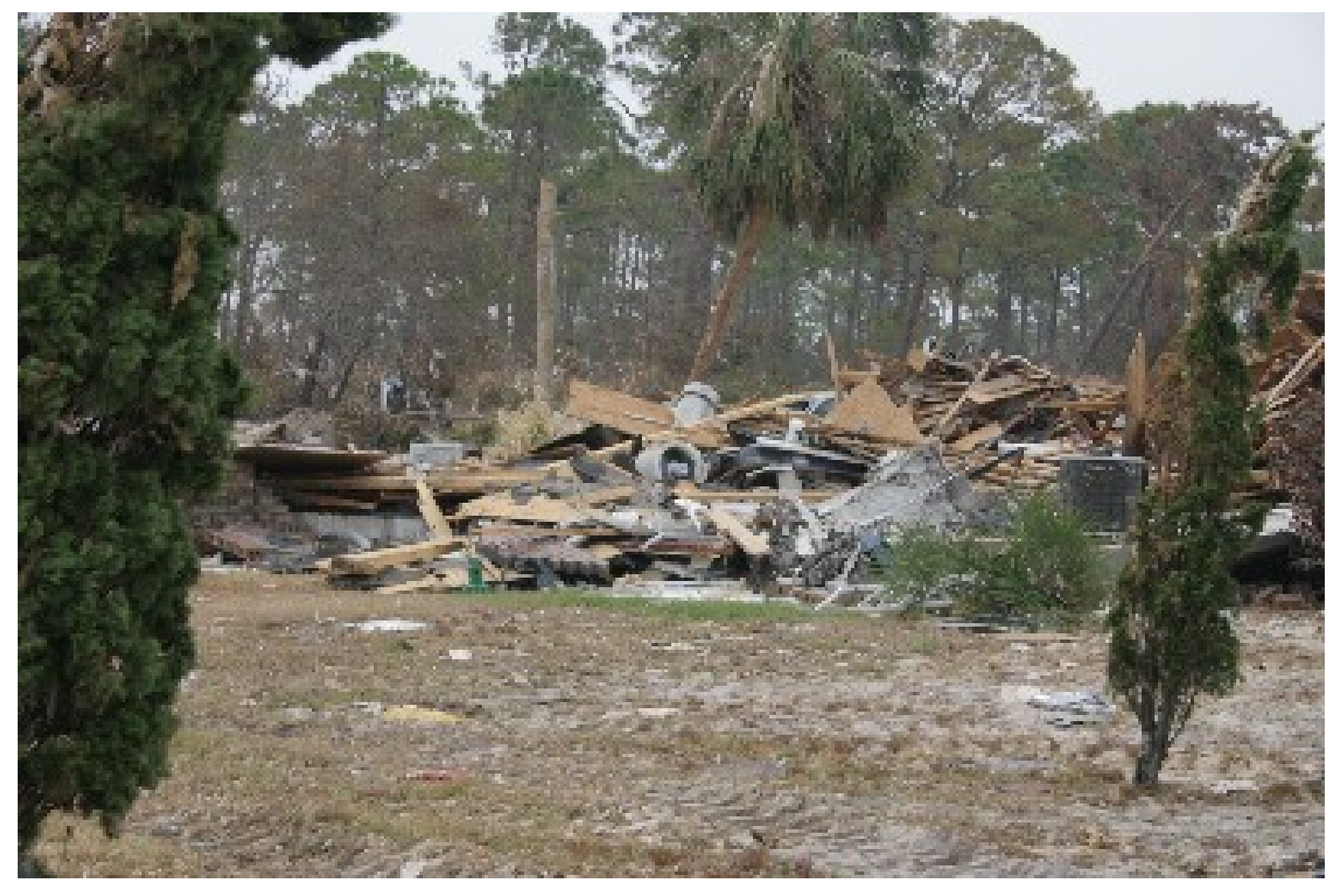
Remains/debris from home in Grande Lagoon subdivision, Holy Spirit parish neighborhood. 9/29/04