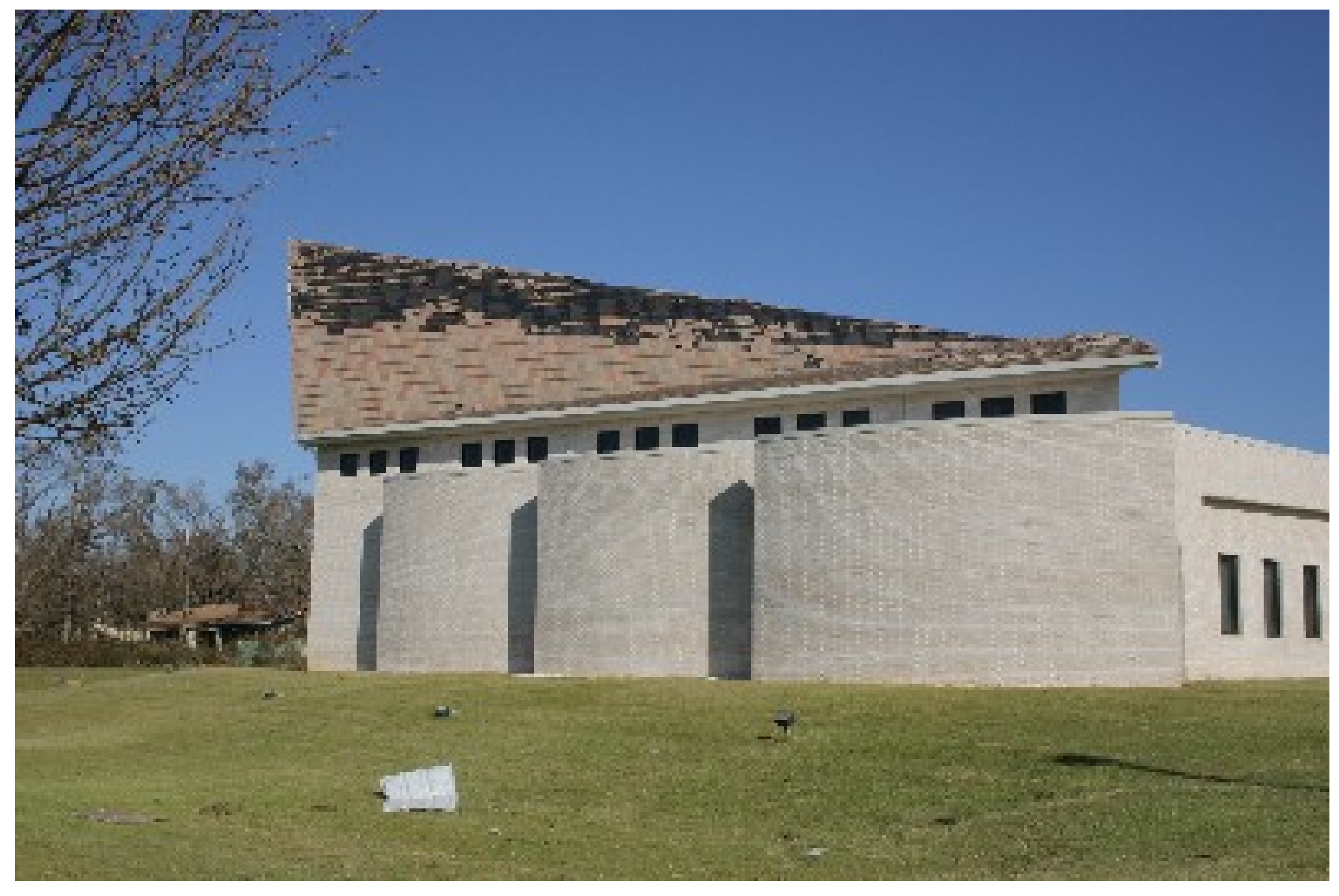
Holy Spirit Catholic Church on Gulf Beach Highway, across from Grande Lagoon subdivision. 9/19/04