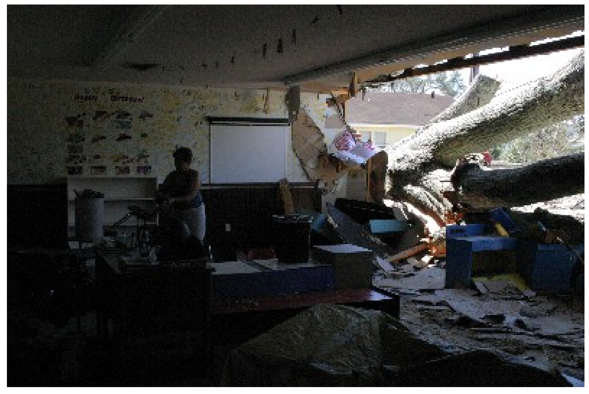
Pre-K4 classroom at St. John the Evangelist, 9/21/04