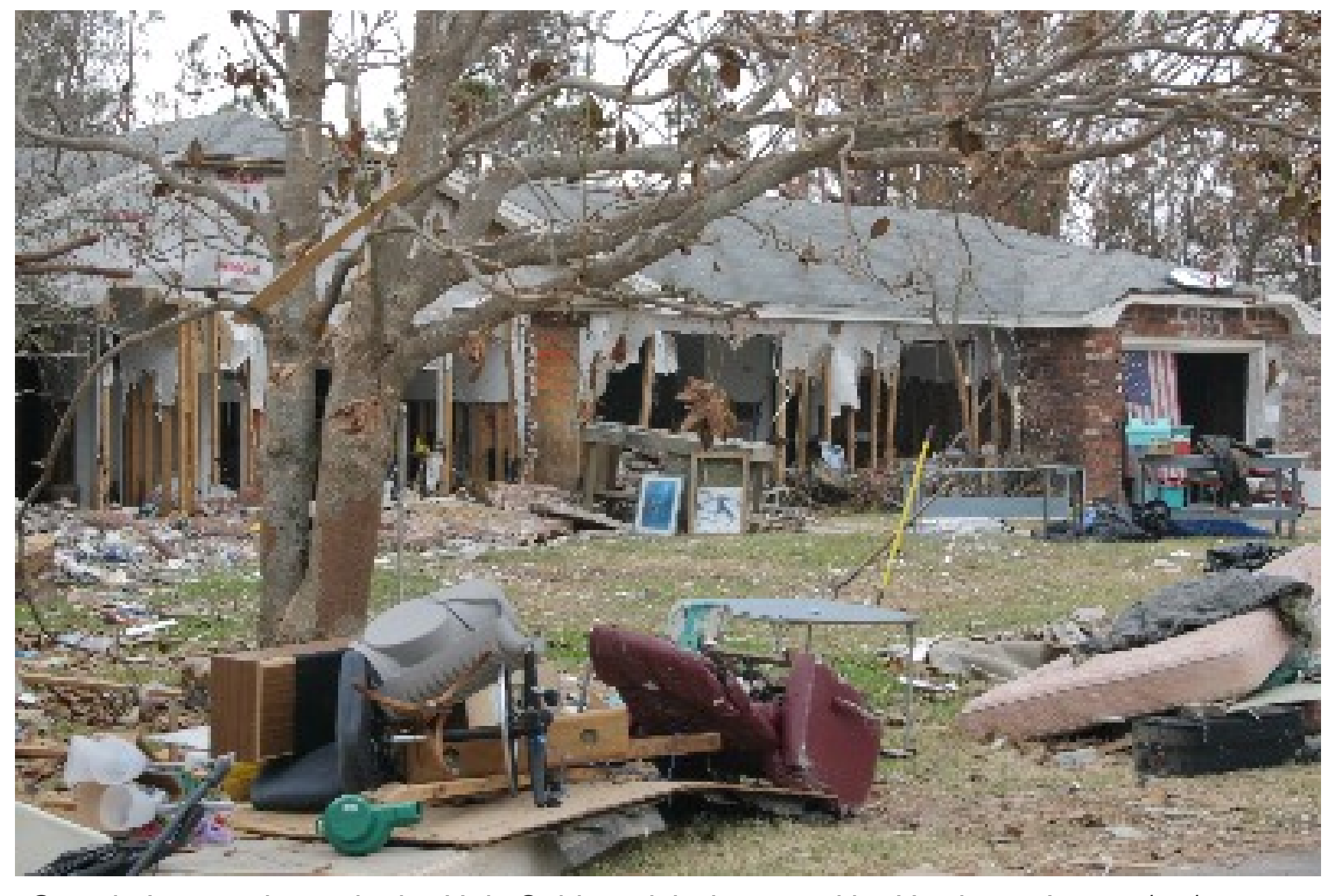
Grande Lagoon home in the Holy Spirit parish destroyed by Hurricane Ivan. 9/29/04