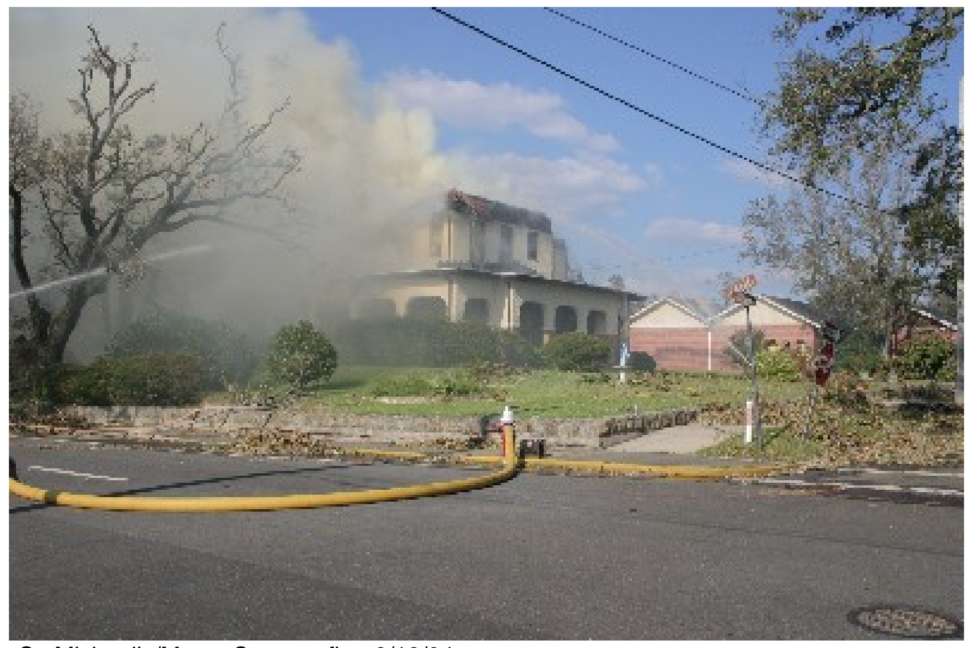
St. Michael's/Mercy Convent fire, 9/19/04.