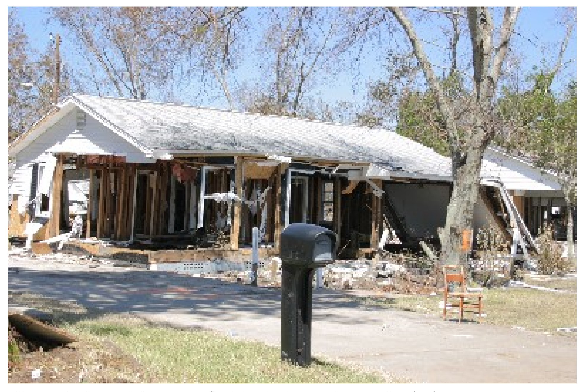
Navy Point home, Warrington, St. John the Evangelist parish. 9/21/04