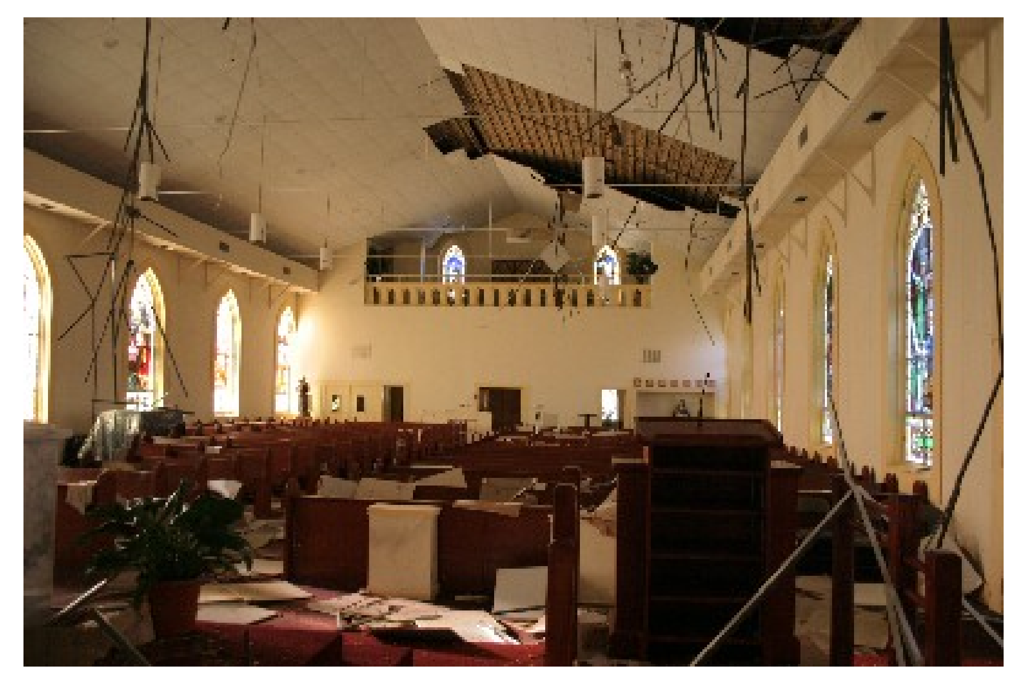
St. Joseph Catholic Church, downtown Pensacola, 9/19/04