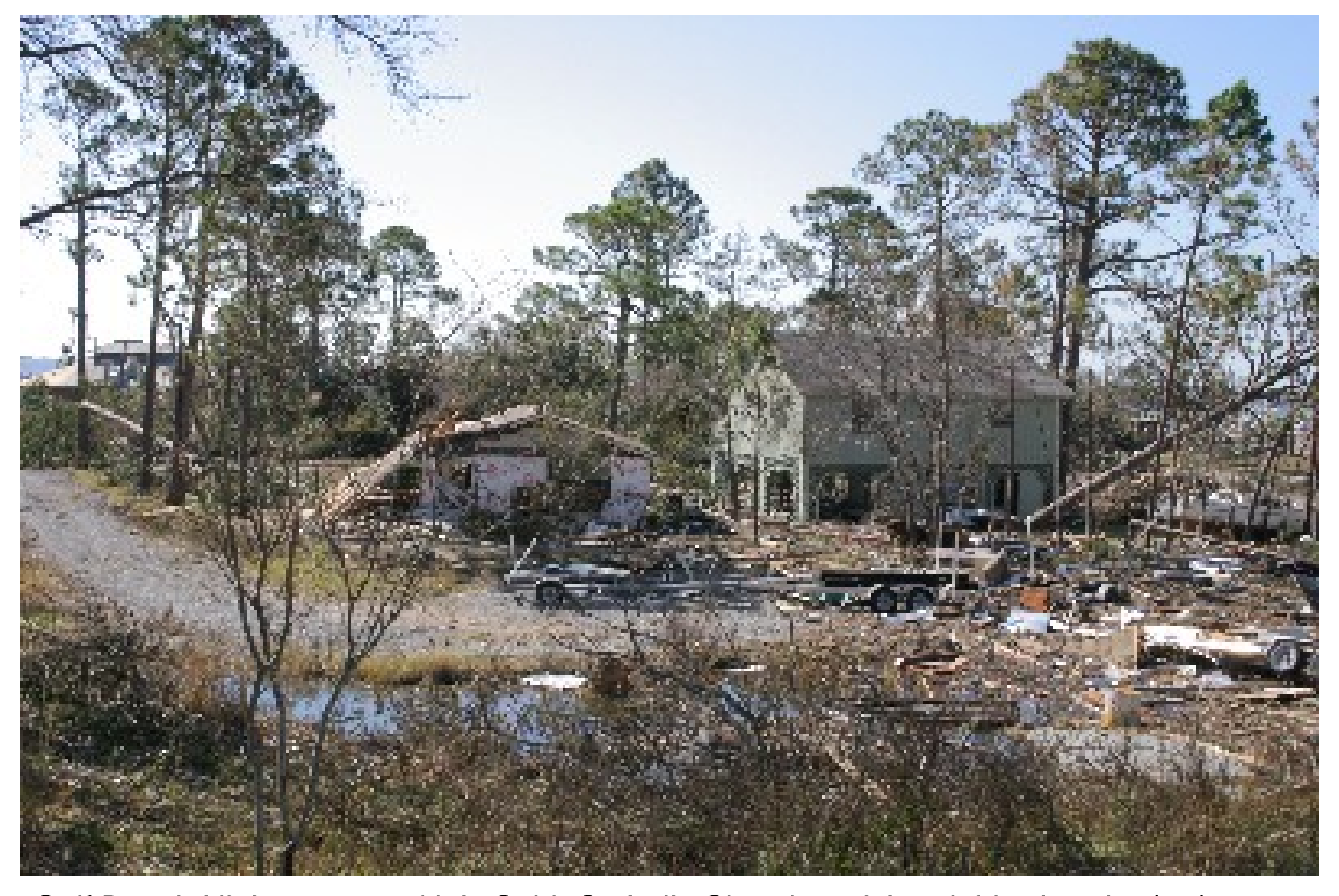
Gulf Beach Highway area, Holy Spirit Catholic Church parish neighborhood, 9/19/04