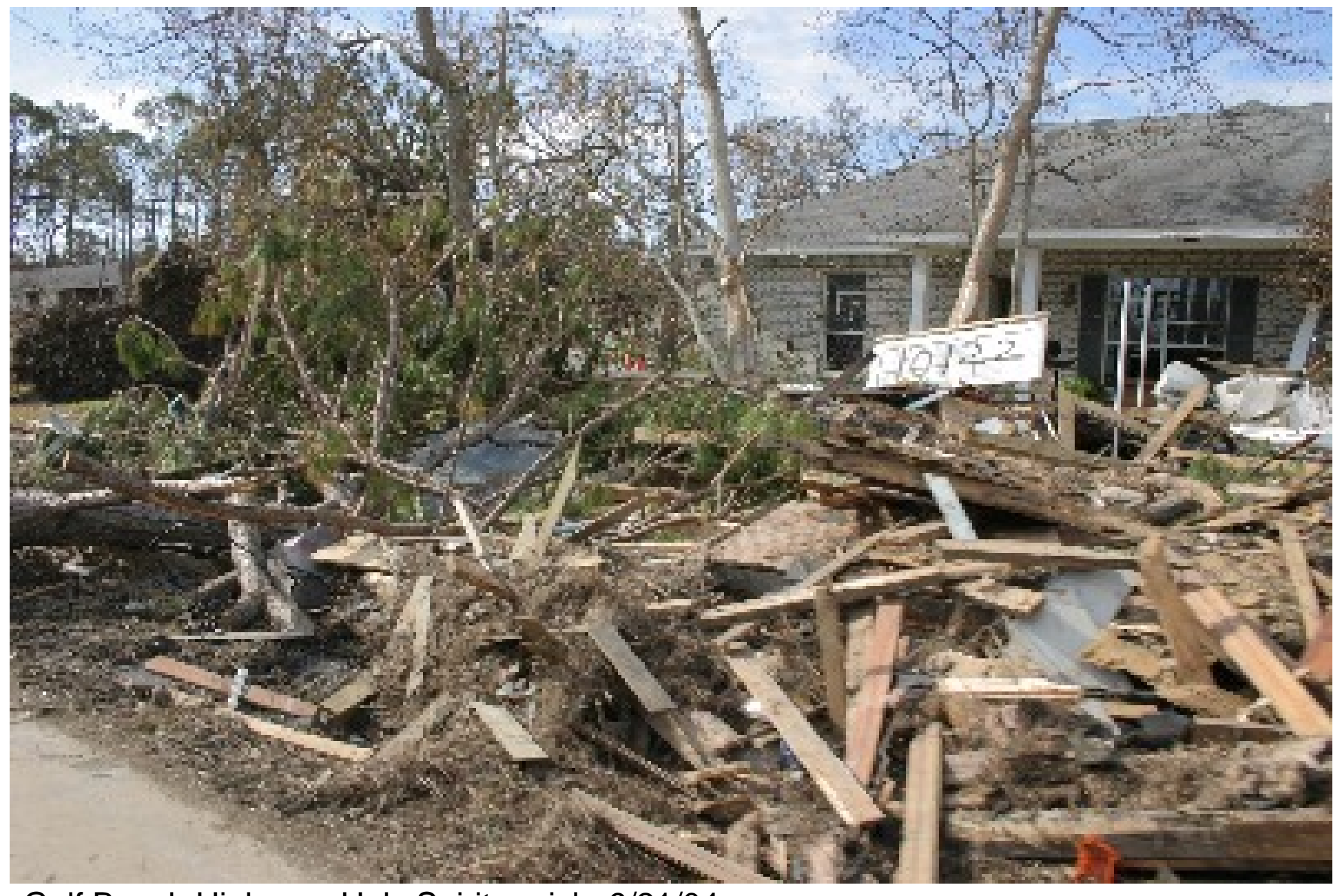
Gulf Beach Highway, Holy Spirit parish, 9/21/04