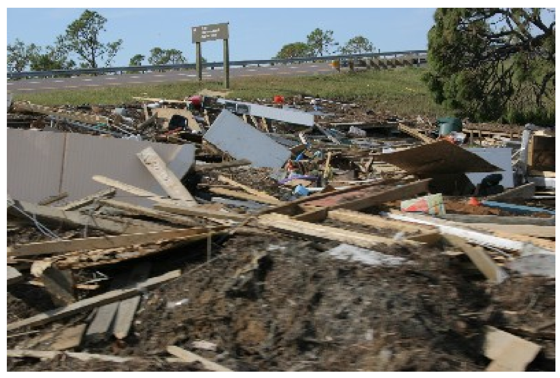
Debris field from Ivan storm surge, Perdido Key, 9/21/04.