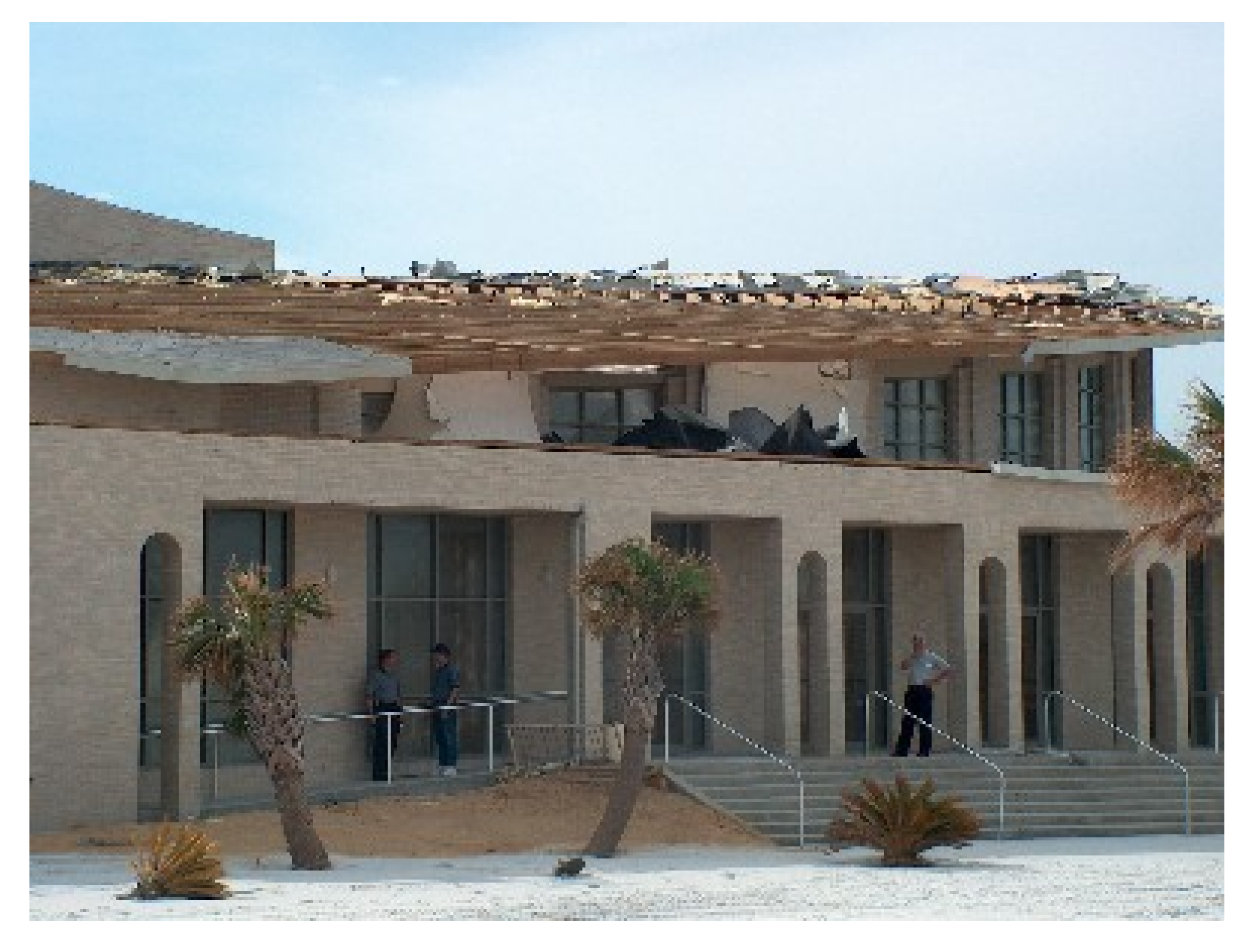
Our Lady of the Assumption, Pensacola Beach, exterior, 9/22/04