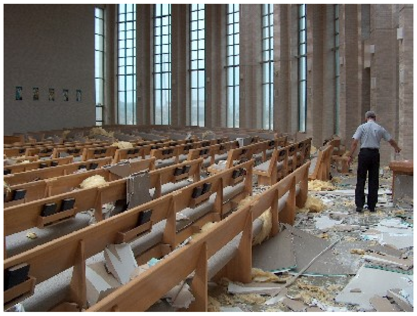
Our Lady of the Assumption, Pensacola Beach, 9/22/04