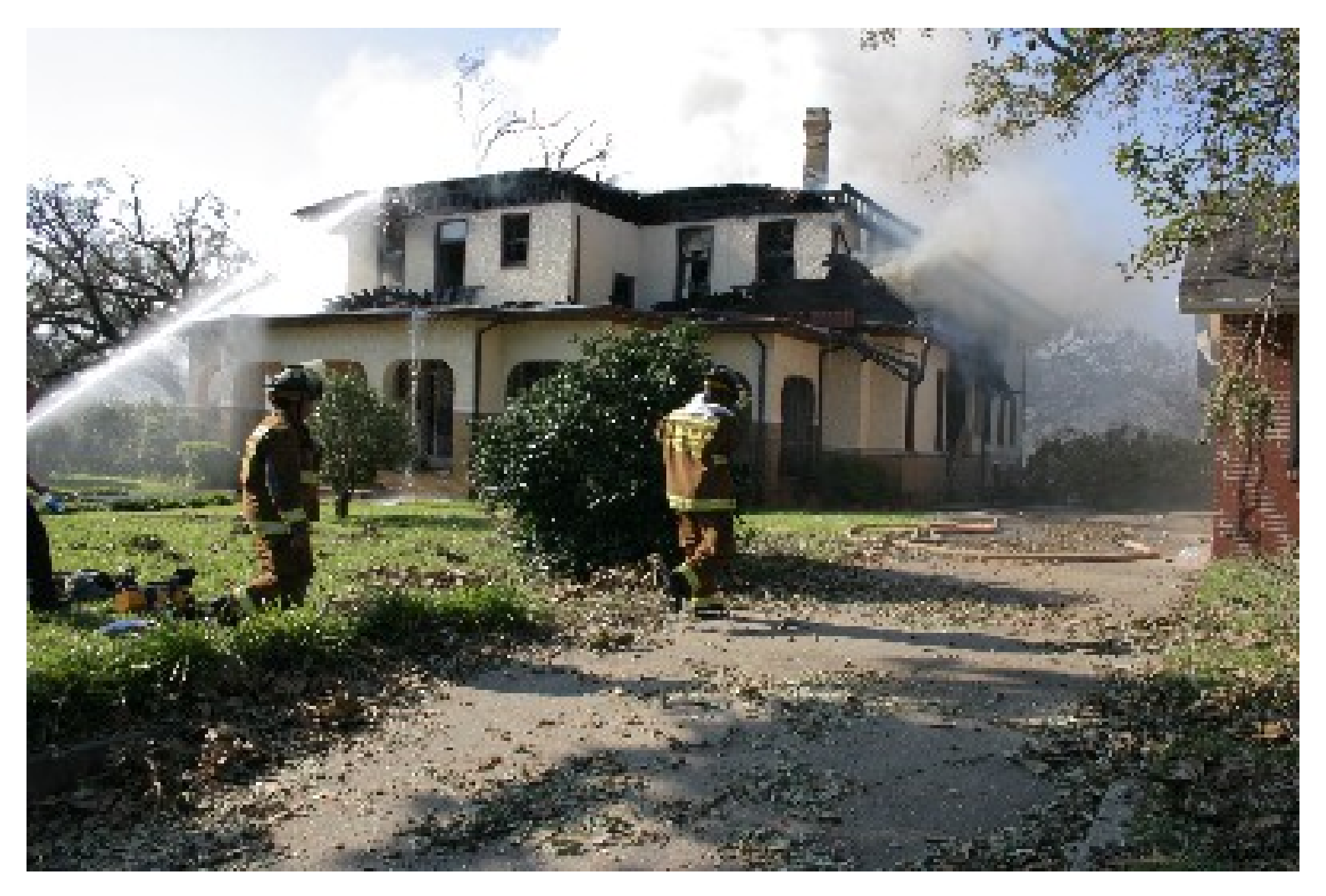
St. Michael's/Mercy Convent fire, 9/19/04. Restoration of power to the convent's old wiring is thought to have been the cause of the fire.