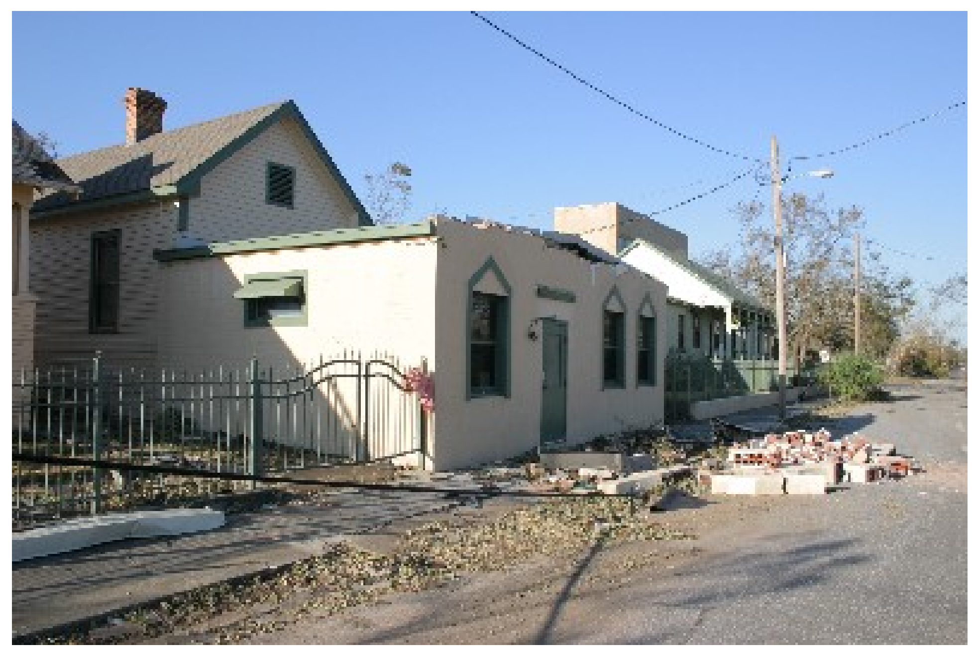
Our Lady of Angels Chapel at St. Joseph, downtown Pensacola, 9/19/04