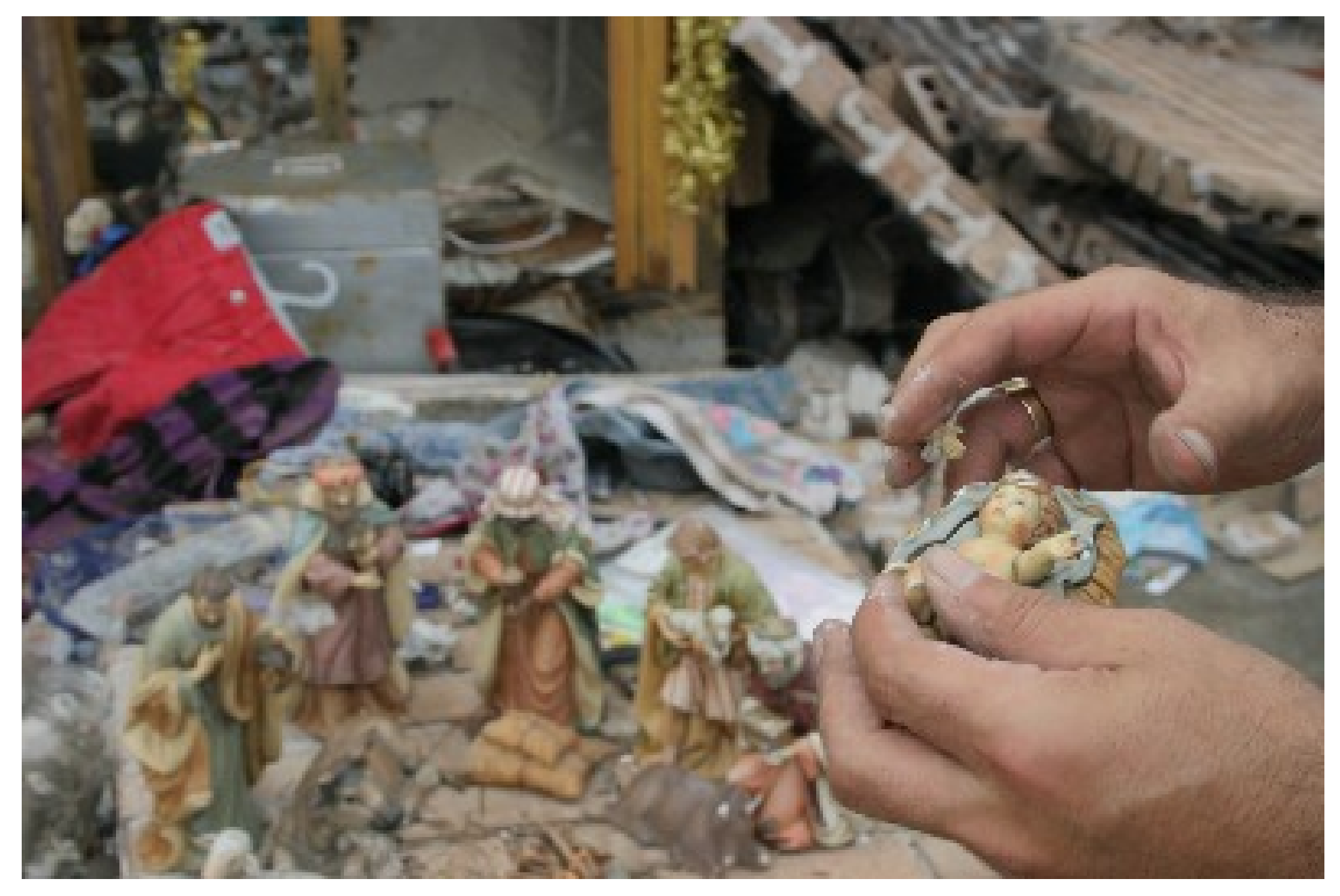
Grande Lagoon resident shows the nativity set he recovered from the rubble of his home in the Holy Spirit parish neighborhood. 9/29/04