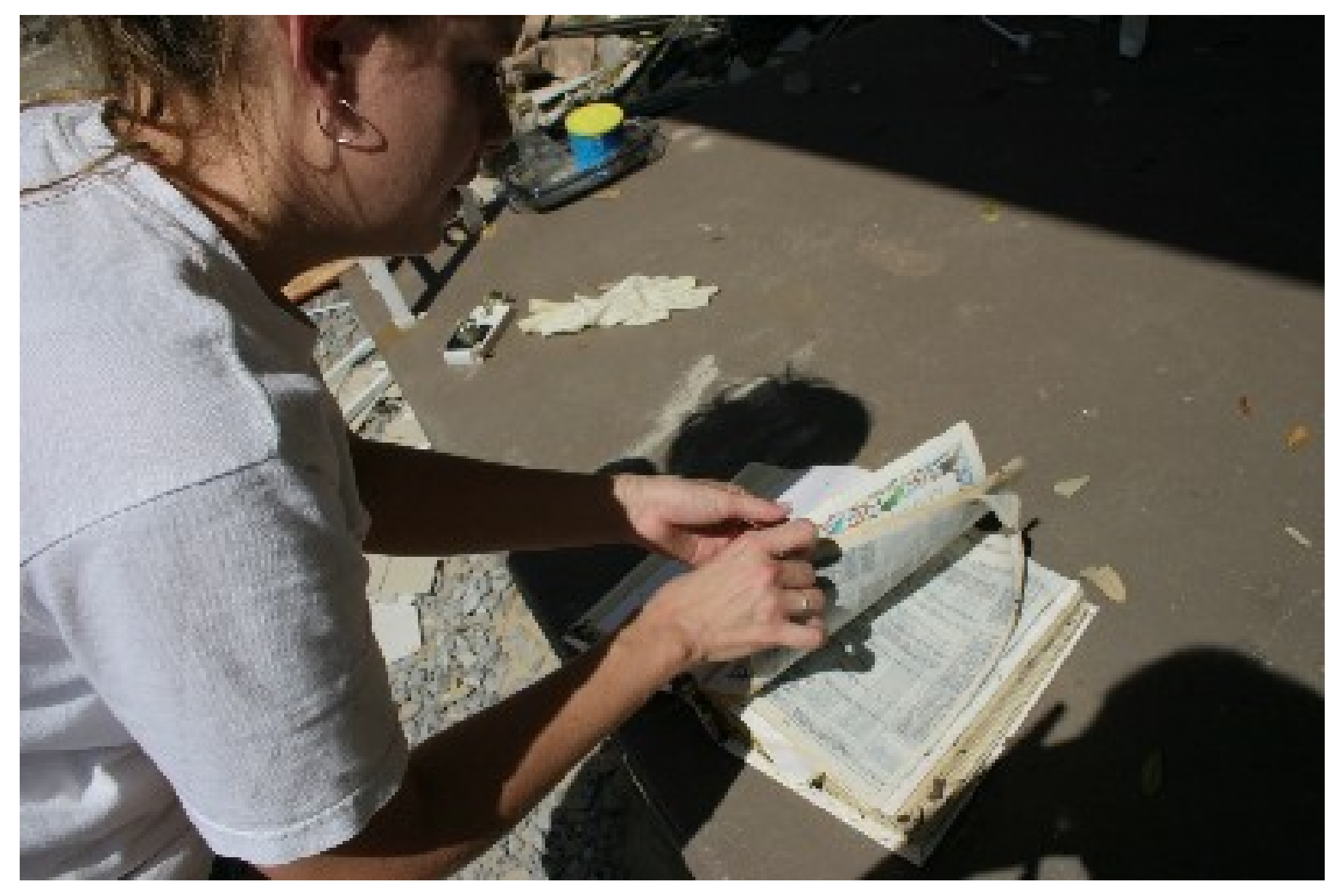
Navy Point resident displays a bible that washed into her home from an unknown owner during Hurricane Ivan, 9/21/04.