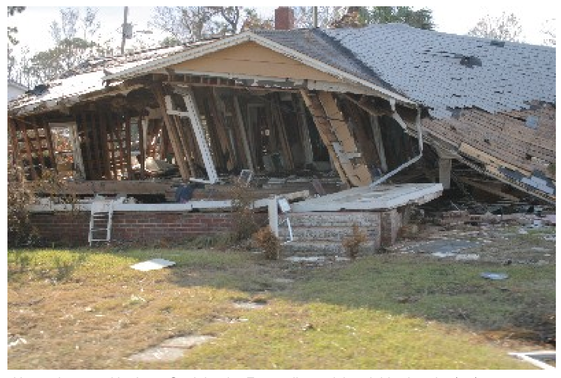
Home destroyed by Ivan, St. John the Evangelist parish neighborhood. 9/25/04