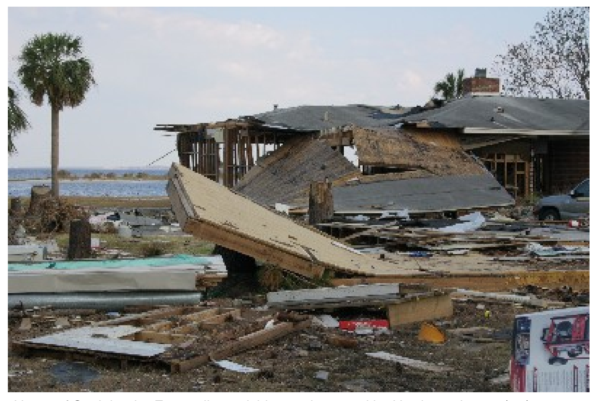
Home of St. John the Evangelist parishioner, destroyed by Hurricane Ivan, 9/25/04