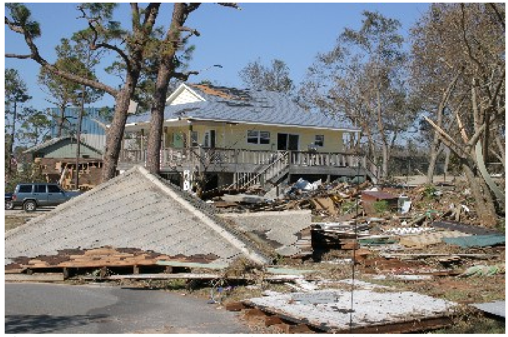
Gulf Beach Highway area, near Holy Spirit Catholic Church, 9/19/04