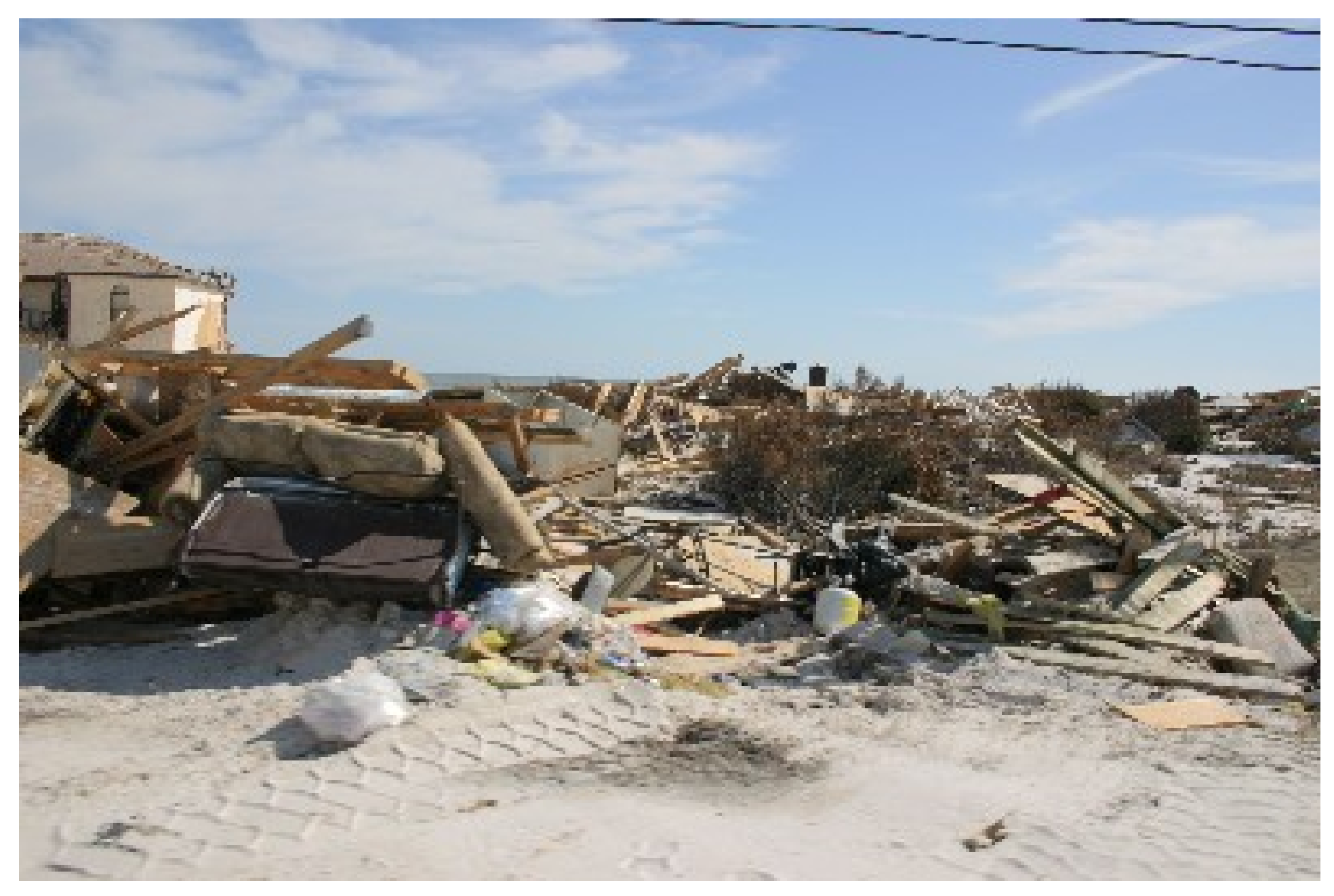
Perdido Key home debris, 9/21/04