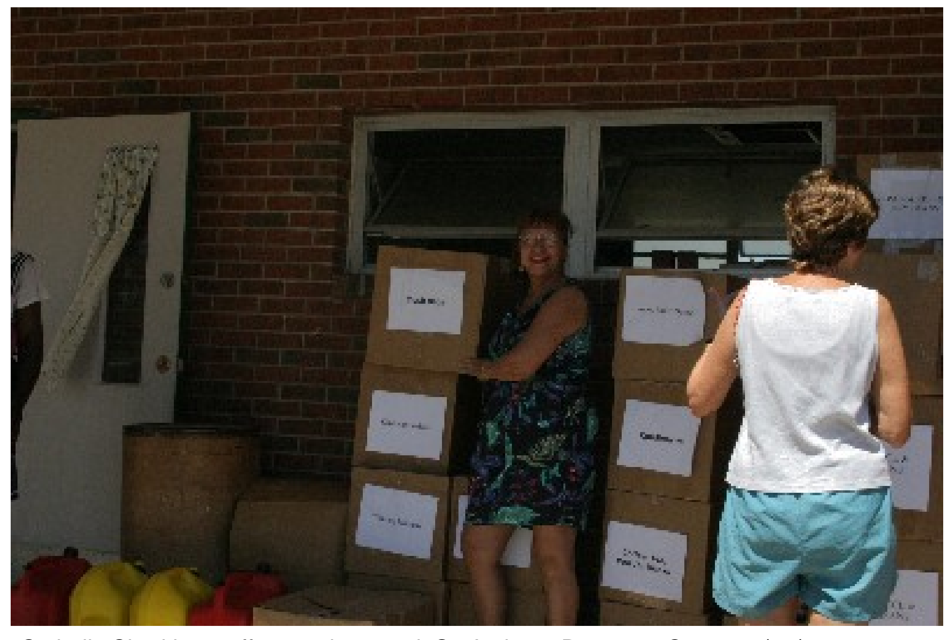
Catholic Charities staffers work to stock St. Anthony Recovery Center, 9/20/04