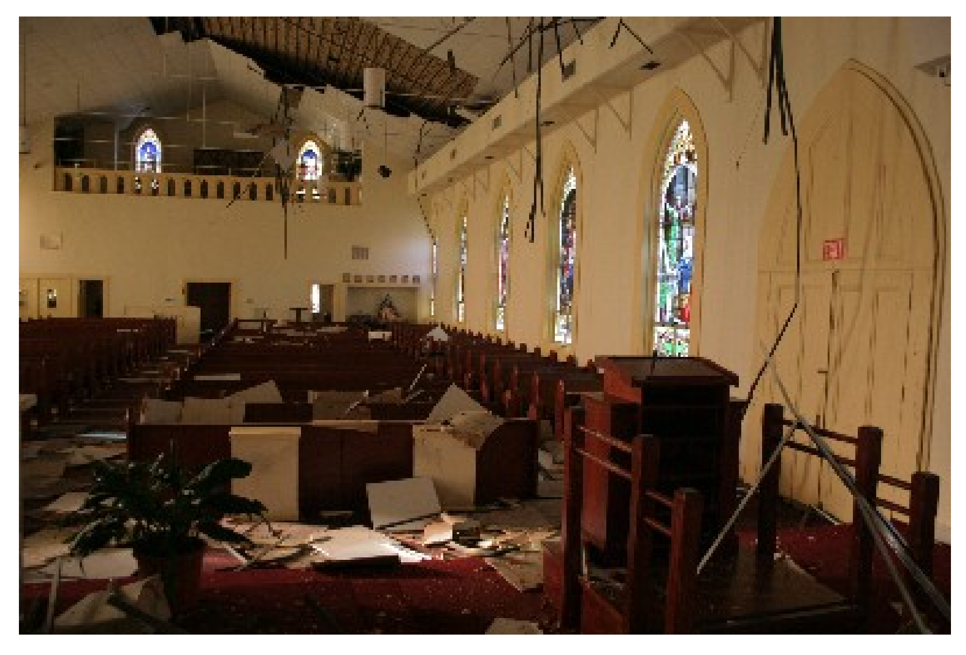
St. Joseph Catholic Church, downtown Pensacola, 9/19/04