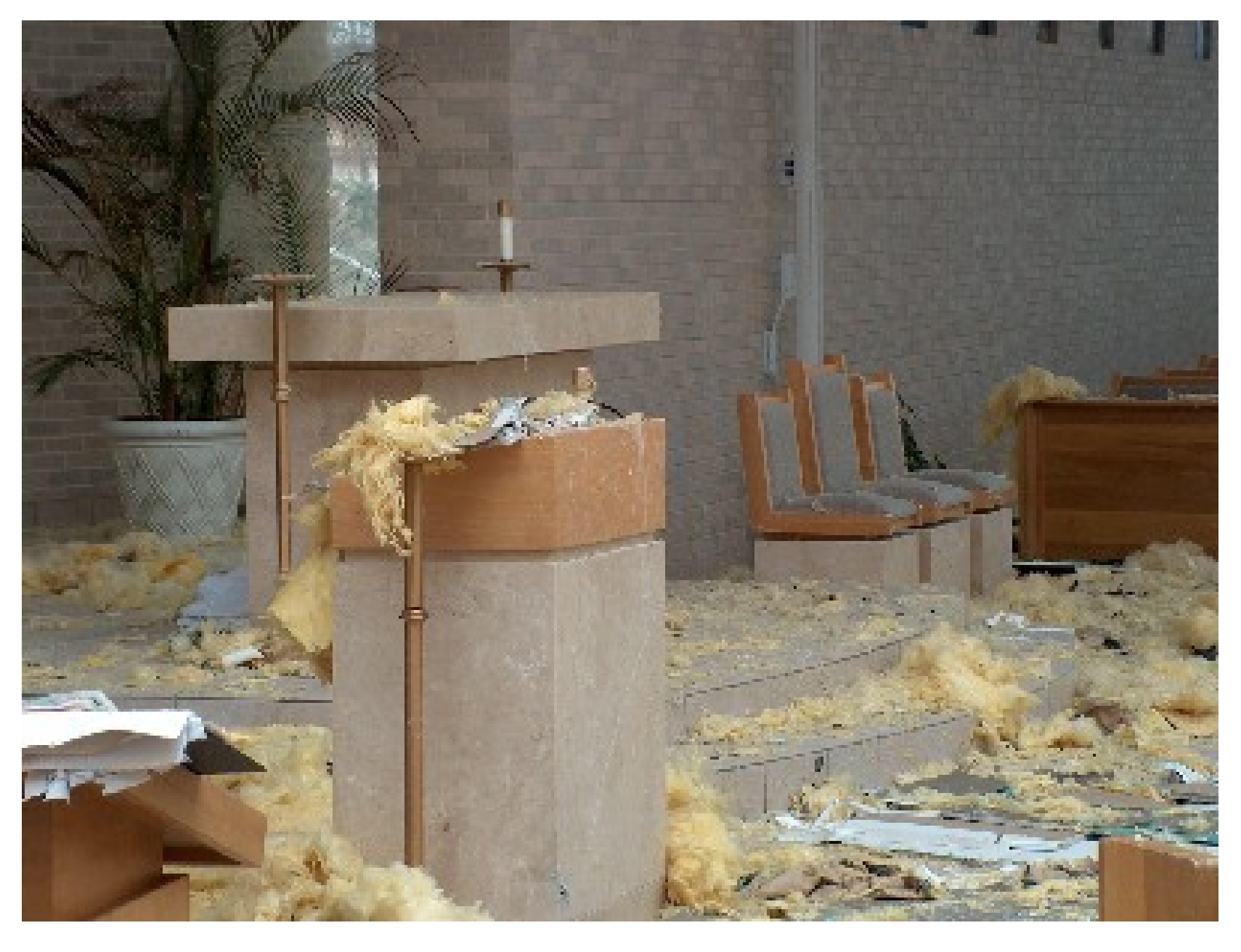
Our Lady of the Assumption, Pensacola Beach, 9/22/04