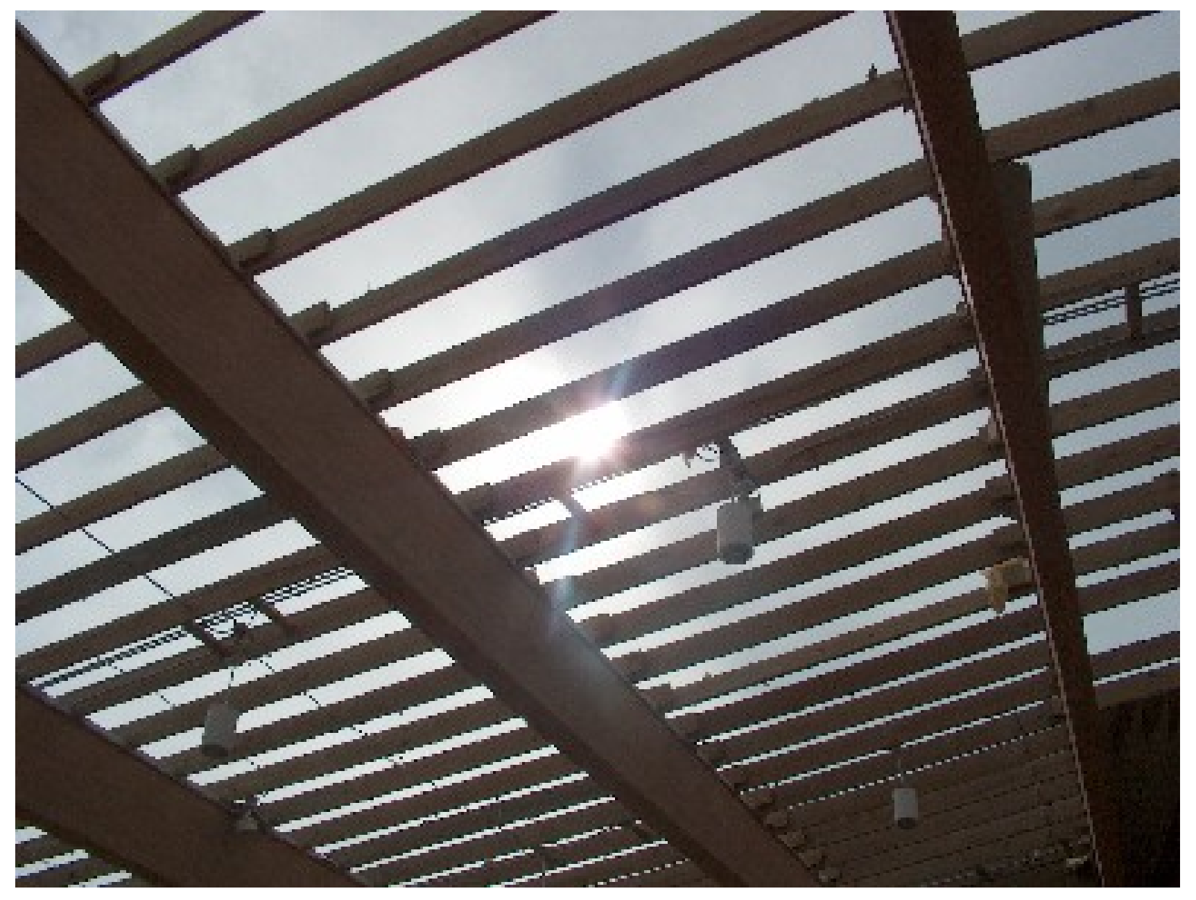
"Roofless" Our Lady of the Assumption, Pensacola Beach, 9/22/04